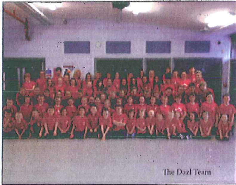
The Dazl Team

To transport a group to competitions isn’t always easy. “Some of the group’s younger members are from low income families and parents don’t have access to transport.”